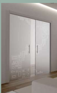
Glass door options also available please call for further details